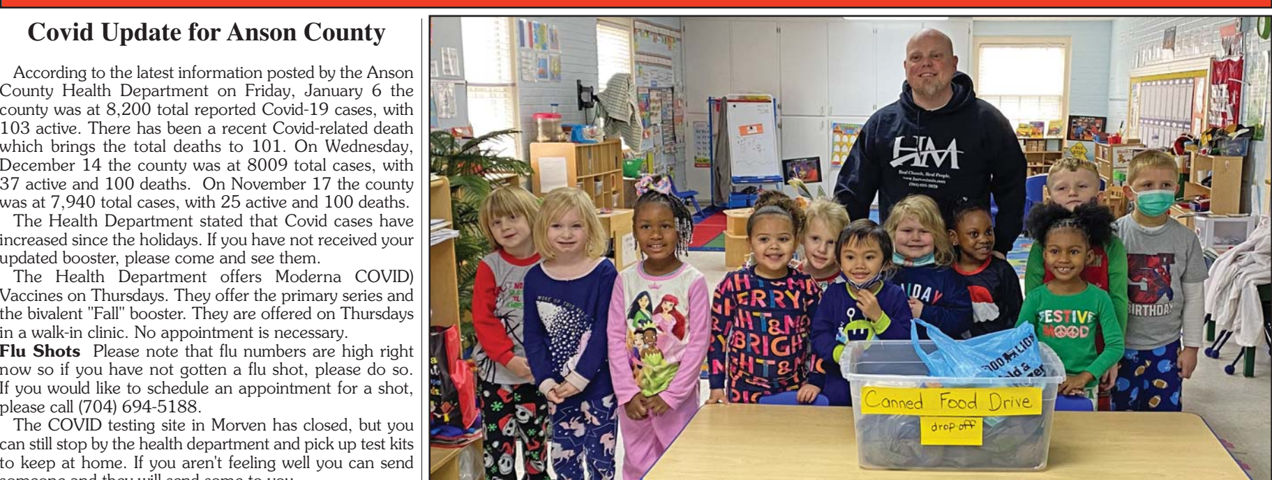
Pre-K Class at First Methodist Church Makes Food Donation

will come out and participate in this wonderful opportunity.