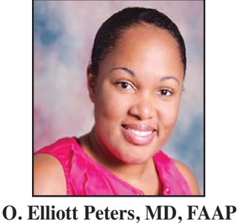
Serving Anson County Since 2008