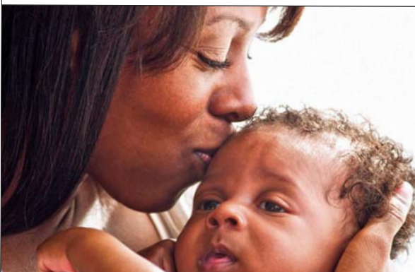
All services are free and confidential Mon & Tue 1:30-4