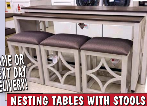
NESTING TABLES WITH STOOLS

MARTIN FURNITURE FACTORY OUTLET Highway 74 West in Wadesboro • 704-694-3185 Mon-Fri 8:30-5 Closed Saturday 8:30-1 Sunday