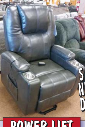
POWER LIFT RECLINER