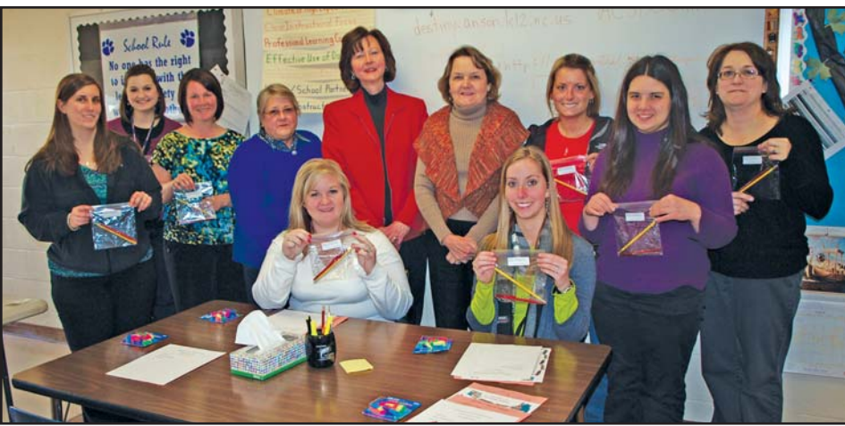
in the Learning Development Centers throughout the school system.