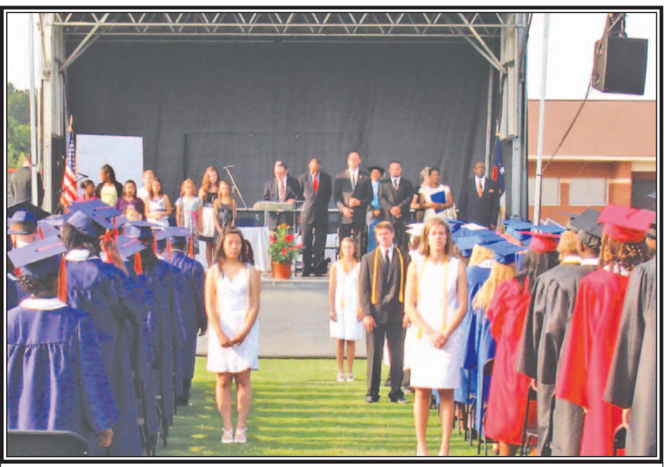
Last year's high school's Commencement Ceremony unified graduating seniors into one ceremony. An elevated stage and the use of a professional audio system enhanced the experience for all involved.