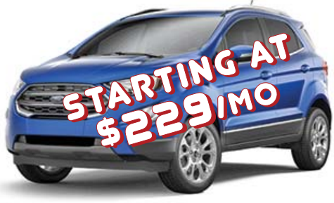
2018 Ford EcoSport Several to choose from