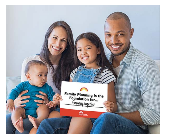
Schedule a physical and/or birth control consult today.