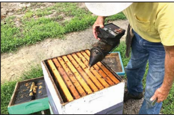
Using a smoker to get bees moving inside the hive.