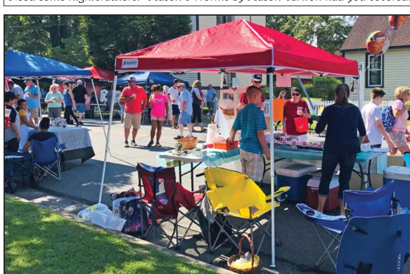
The Anson County Kids Expo drew a great turnout...and offered great deals too!