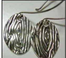
Metal clay earrings