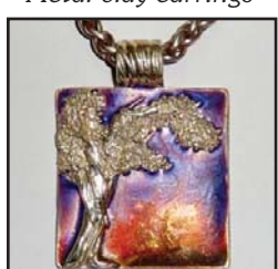
Metal clay necklace

Metal Clay instruction continues on Friday, September 13 with two workshops. A Beginner's Metal Clay workshop will be held from 9am-12noon ($95) with an Intermediate class creating a Picturesque Silver Tree Pendant ($120) from 1-4pm. Fine metal clays are versatile and easy to use, allowing participants to make jewelry in just a few hours. Registration is required with all supplies provided.