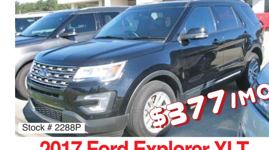
2017 Ford Explorer XLT