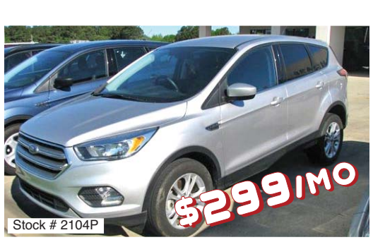
2017 Ford Escape SE