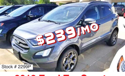
2018 Ford EcoSport