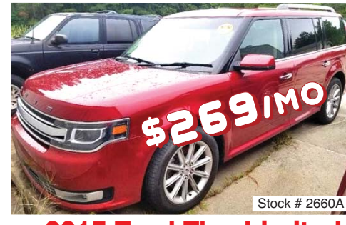
2015 Ford Flex Limited