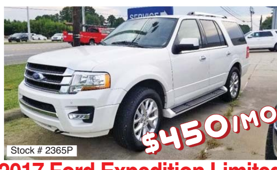
2017 Ford Expedition Limited