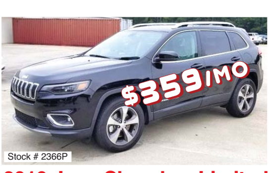
2019 Jeep Cherokee Limited