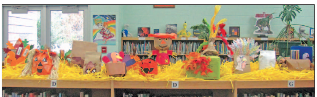
Peachland-Polkton Kindergarten students made Fall Projects out of brown paper bags.