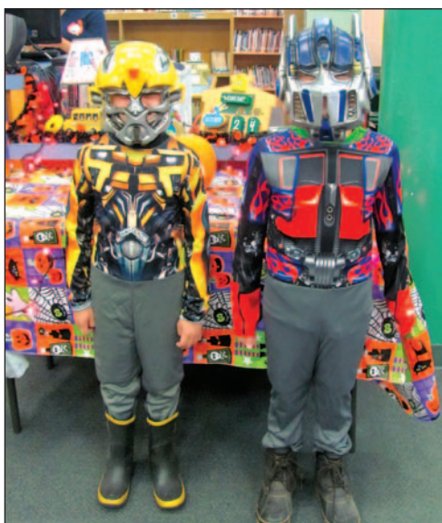
Peachland-Polkton Elementary School began its annual Media Night by hosting a Spooktacular Media Night theme on October 24th. Media Nights at PPES are held once a month, from 3 until 7 p.m. Students, accompanied by an adult, have access to all media materials during that time.