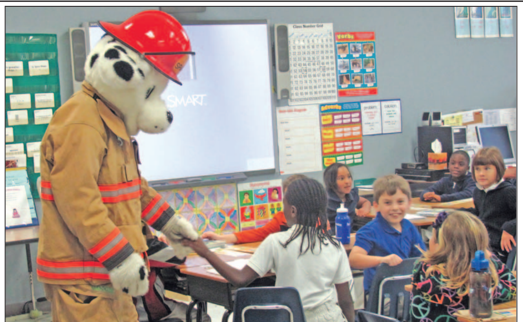
Peachland-Polkton Elementary School celebrated Fire Prevention Week during the month of October. The Polkton Fire Department came out with a fire truck and Sparky visited classrooms.

For more information, contact the Anson County Chamber of Commerce at 704-694-4181 or ansonchamber@windstream.net .