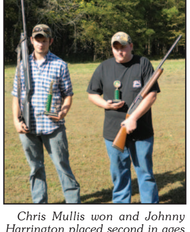
Harrington placed second in ages 17 and 18 competition.