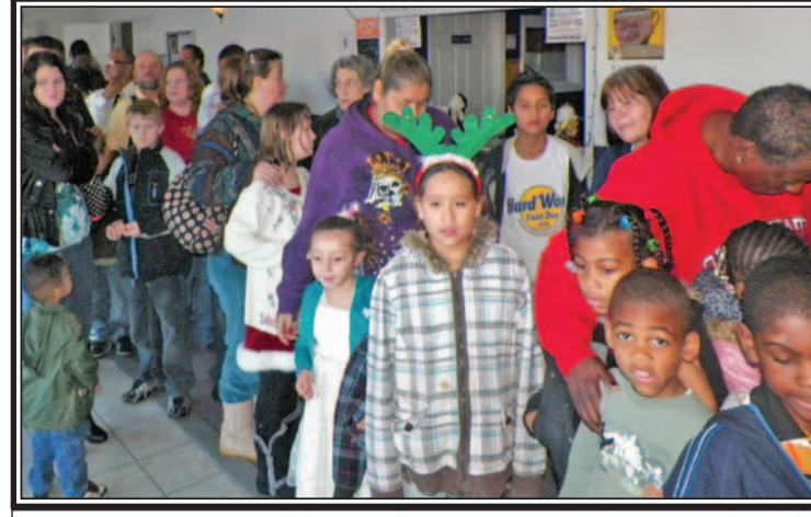
Here are just some of the nearly 1,000 people who enjoyed a delicious Christmas meal and lots of fun at Harvest Ministries last week.