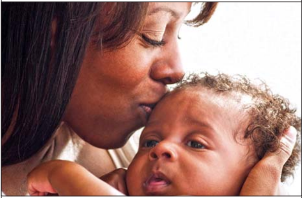
All services are free and confidential Mon & Tue 1:30-4