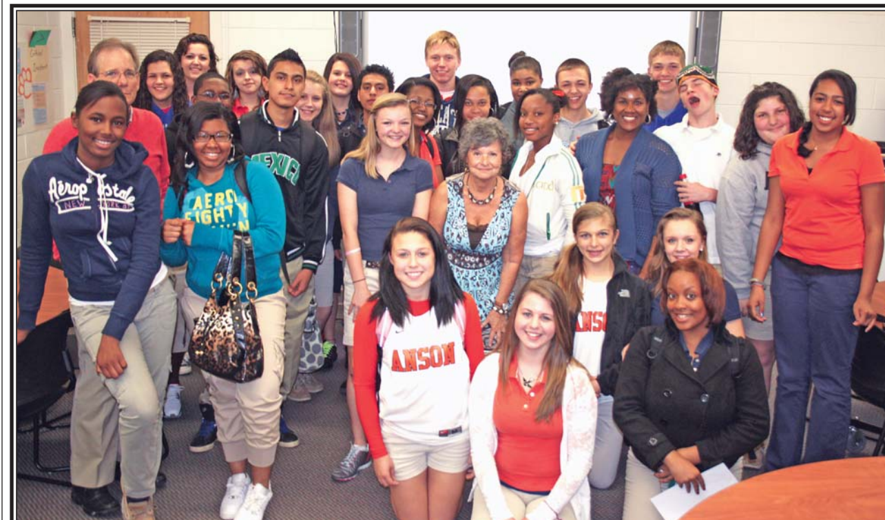
These Anson High School students are helping students in the African country of Malawi learn English through a project called the Malawi Pen Pal Project. Read more about this fascinating project on page 6.