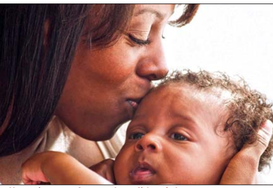
All services are free and confidential Mon & Tue 1:30-4

Blood Drive is March 20 The Community Blood Center of the Carolinas will hold a Blood Drive on Tuesday, March 20, from 10:30 a.m. to 1:30 p.m. at South Piedmont Community College in Polkton.