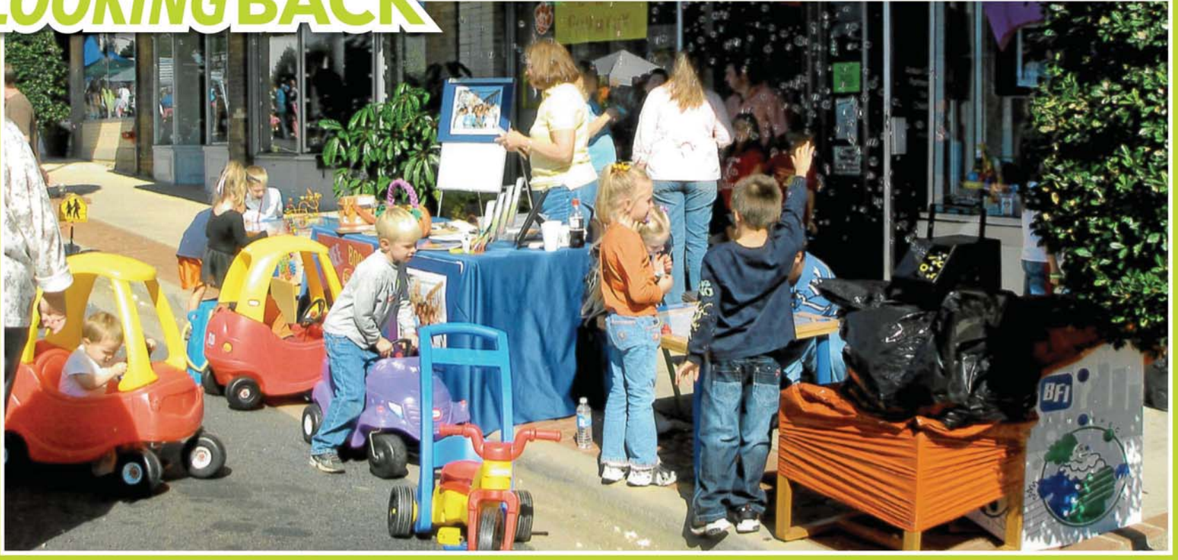
Children busy playing in front of the Anson County Partnership for Children office on Greene Street.