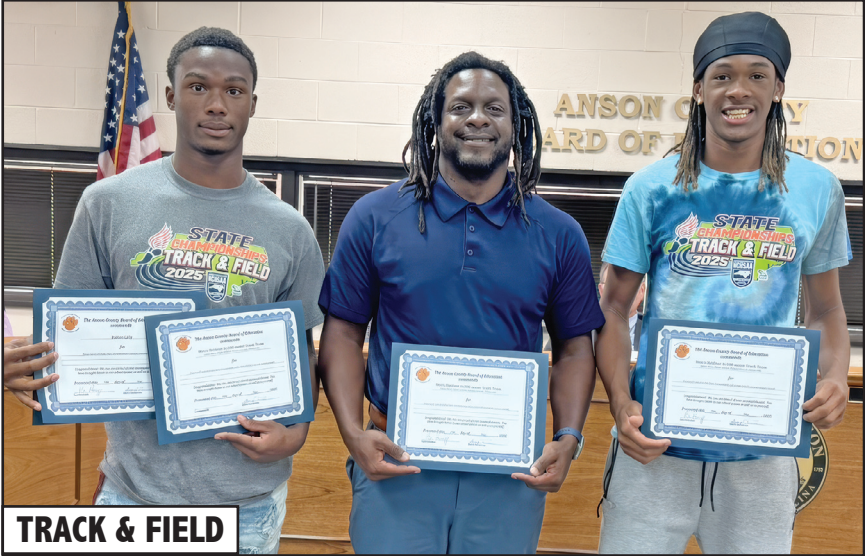
TRACK & FIELD

We are incredibly proud of these student-athletes and their coaches for their outstanding accomplishments. Your dedication, discipline, and drive truly exemplify the spirit of Bearcat athletics. Keep striving for greatness! (Baseball, Soccer and Golf were not present.)