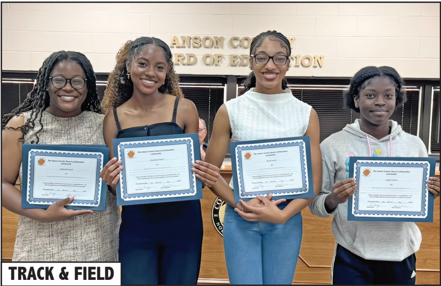
TRACK & FIELD