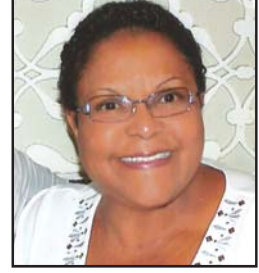
Accepting New Patients