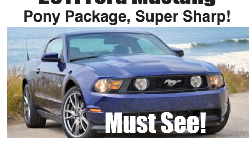
$229 per month