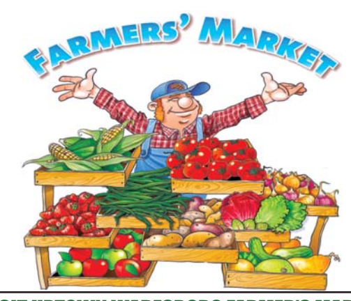
VISIT UPTOWN WADESBORO FARMER'S MARKET

To be eligible for the honor roll Bailey maintained a weighted grade point average of 3.5 or higher in at least five academic courses while maintaining the status of a student in good standing with the Judicial Board and administration.