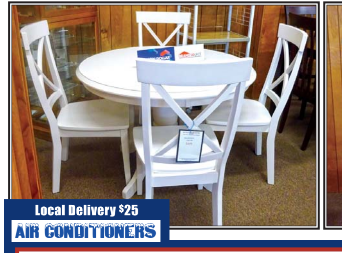
TABLE WITH 4 CHAIRS & UTILITY STAND Was $618 Now Only $499 !!!