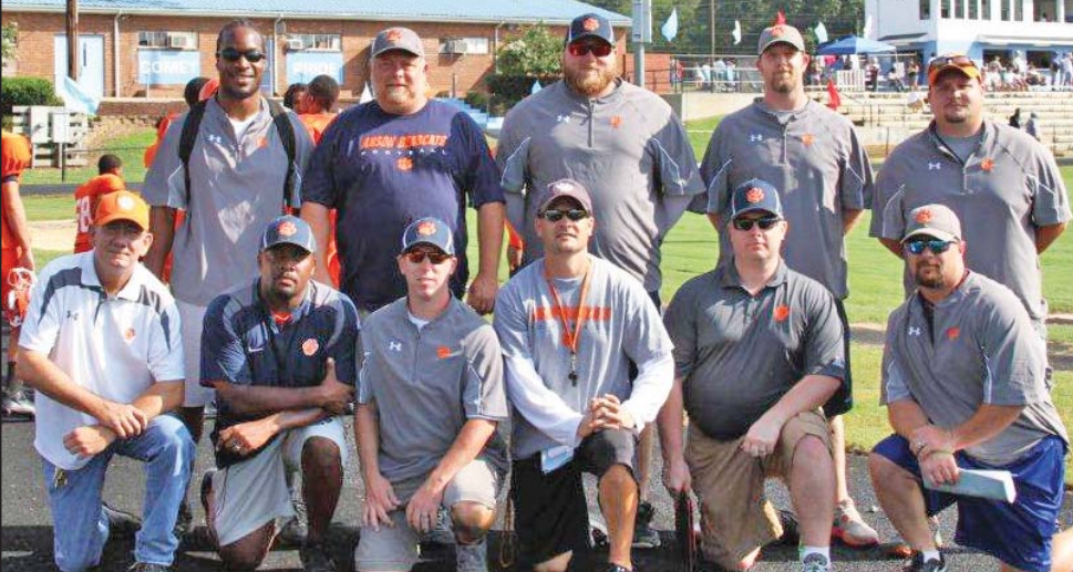
The Anson High School Beacat Football Team Coaching Staff

back those veteran coaches who always give their all. The entire coaching staff, the athletes and the administration all expected 2013 to be a very successful season."