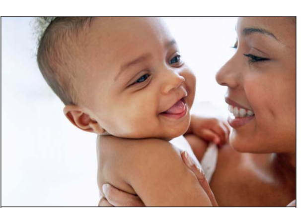
FREE PREGNANCY TESTS & ULTRASOUNDS

too! It's a win-win. And remember, older animals need a home and love too!