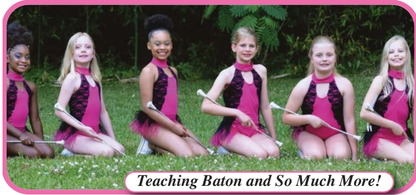
Teaching Baton and So Much More!