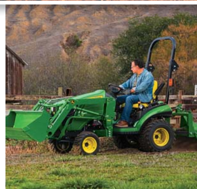
1 Series Tractor Package