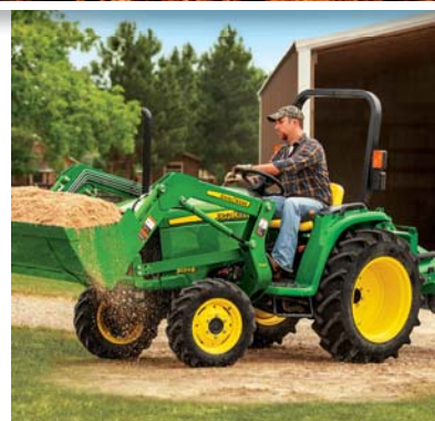
3E Series Tractor Package

We're dedicated to providing affordable, hardworking solutions that help make small work of big jobs. Dependable and loaded with features for every budget, our equipment will help you tackle chores easily, so you can get on with your day.