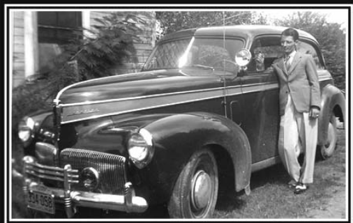
A Collection of Columns

Call The Express for information, 704-694-2480 or visit www.Blurb.com and search "Ed McBride."