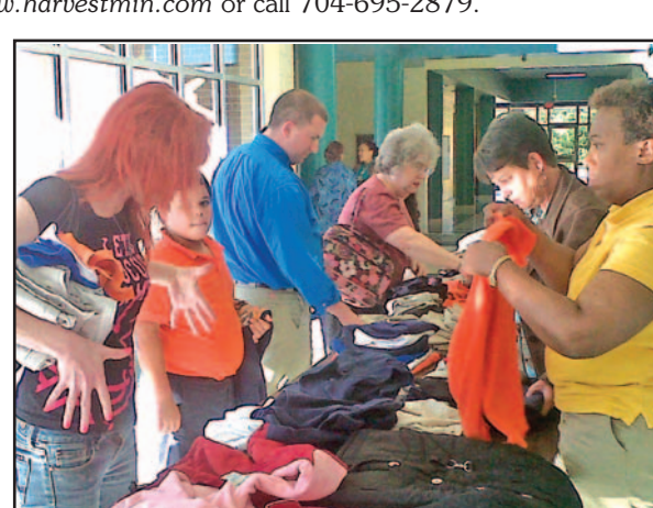
in the event. People helping people...that's what it's all about. By Maresa Dutton Phillips, LES Principal

1ST CHOICE HOUSING IN MONROE 2008 East Roosevelt Street Monroe • 704-225-8850 www.1stchoicemonroe.com