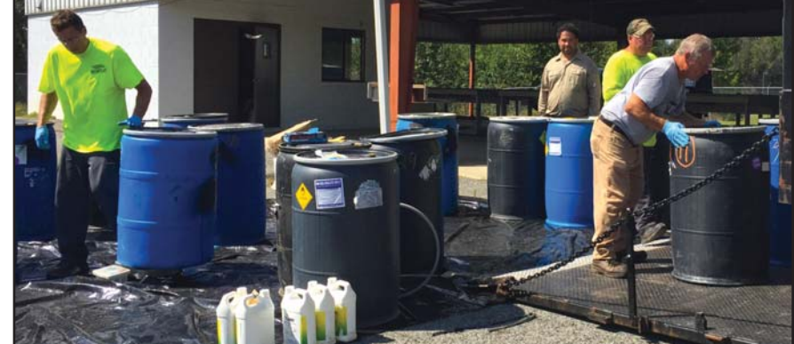
Free Pesticide Collection Day November 30

THE EXPRESS • November 22, 2023 • Page 2