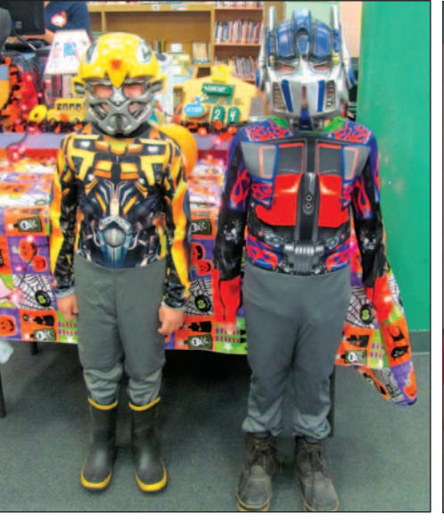
Peachland-Polkton Elementary School began its annual Media Night by hosting a Spooktacular Media Night theme on October 24th. Media Nights at PPES are held once a month, from 3 until 7 p.m. Students, accompanied by an adult, have access to all media materials during that time.