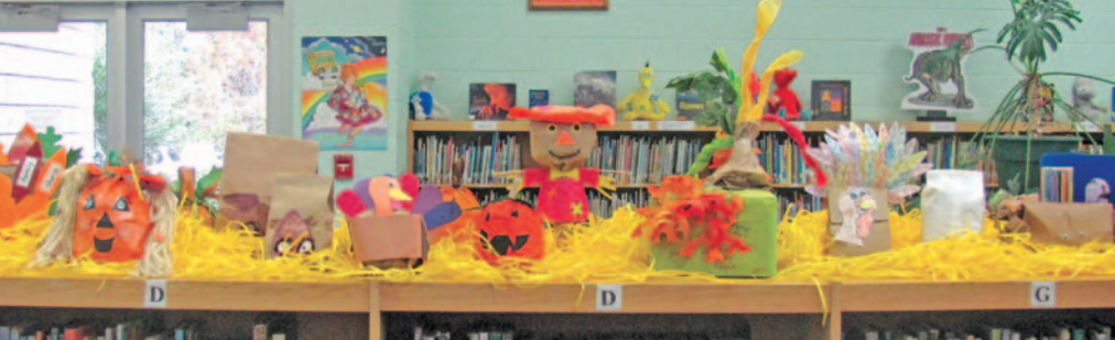
Peachland-Polkton Kindergarten students made Fall Projects out of brown paper bags.