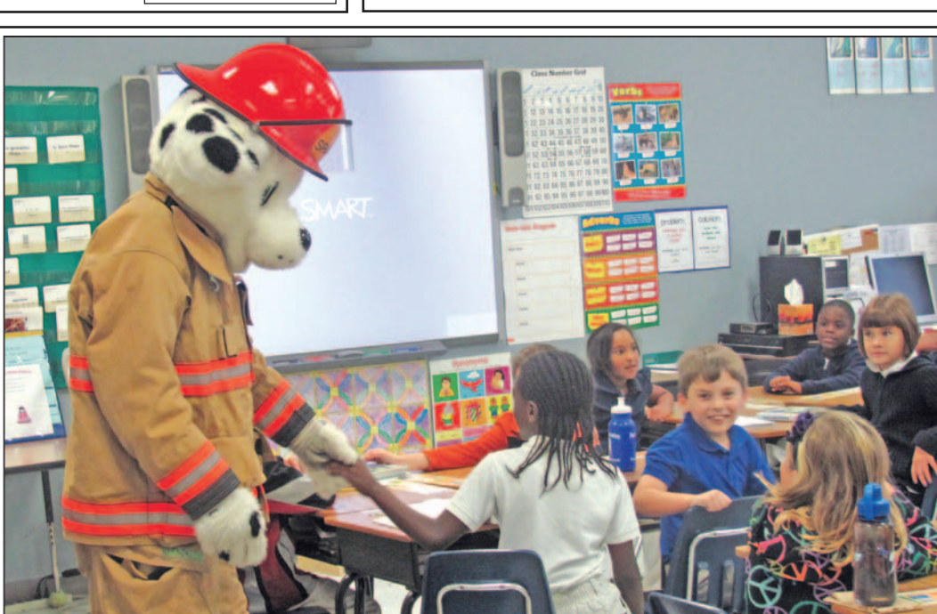
Peachland-Polkton Elementary School celebrated Fire Prevention Week during the month of October. The Polkton Fire Department came out with a fire truck and Sparky visited classrooms.

The 2012 Christmas Parade is scheduled for 4 p.m. on Thursday, December 6th. The uptown parade route will remain the same as in previous years - starting on Morven Road for the line-up and concluding at the Ray Shelton Ball Field for breakdown. The parade will move down Washington, Martin, and Greene Streets. For more information, contact the Anson County Chamber of Commerce at 704-694-4181 or ansonchamber@windstream.net.