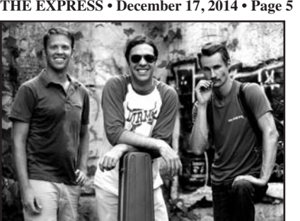
Tickets are $10 for general seating. located at 110 South Rutherford Street, next door to the Ansonia.