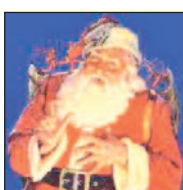
Santa Claus, OD

Don't forget to use your Community Eye Care benefits for you & your family before the end of the year!