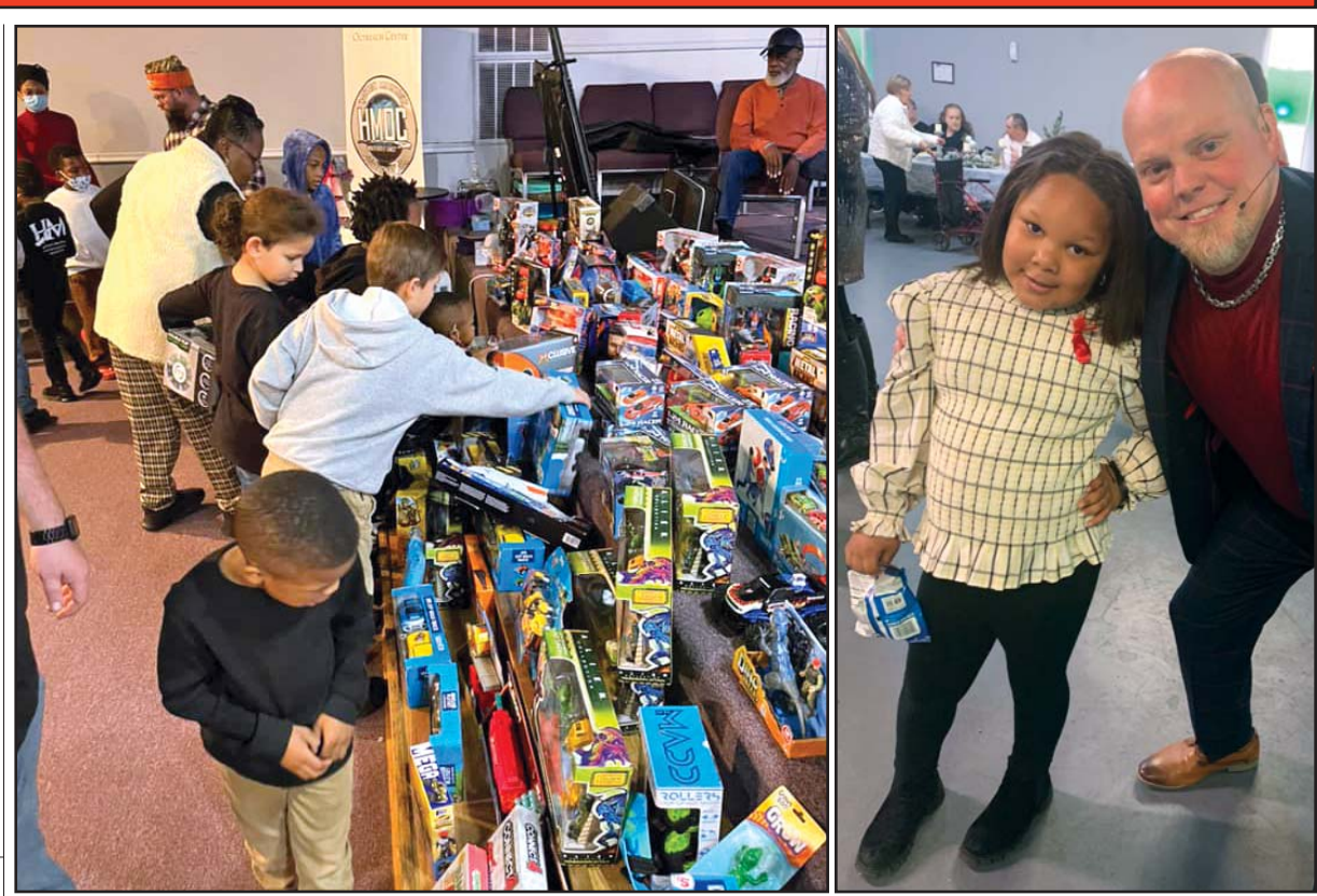
Community Christmas Blessing Year 22 Draws Large Crowd